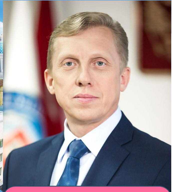
Rector O.G. Smeshko

Date of establishment: 27 th of December 1990